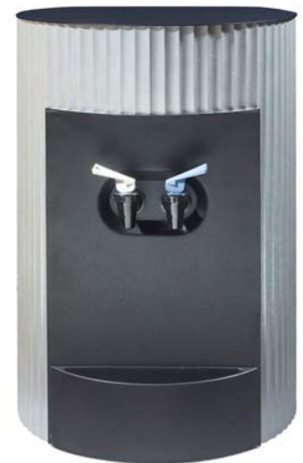
Brushed Chrome Finish Part # CT