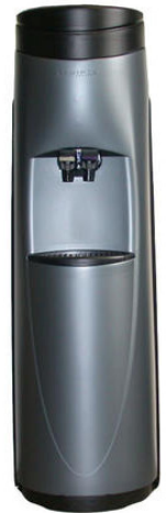
Model FC Model WC